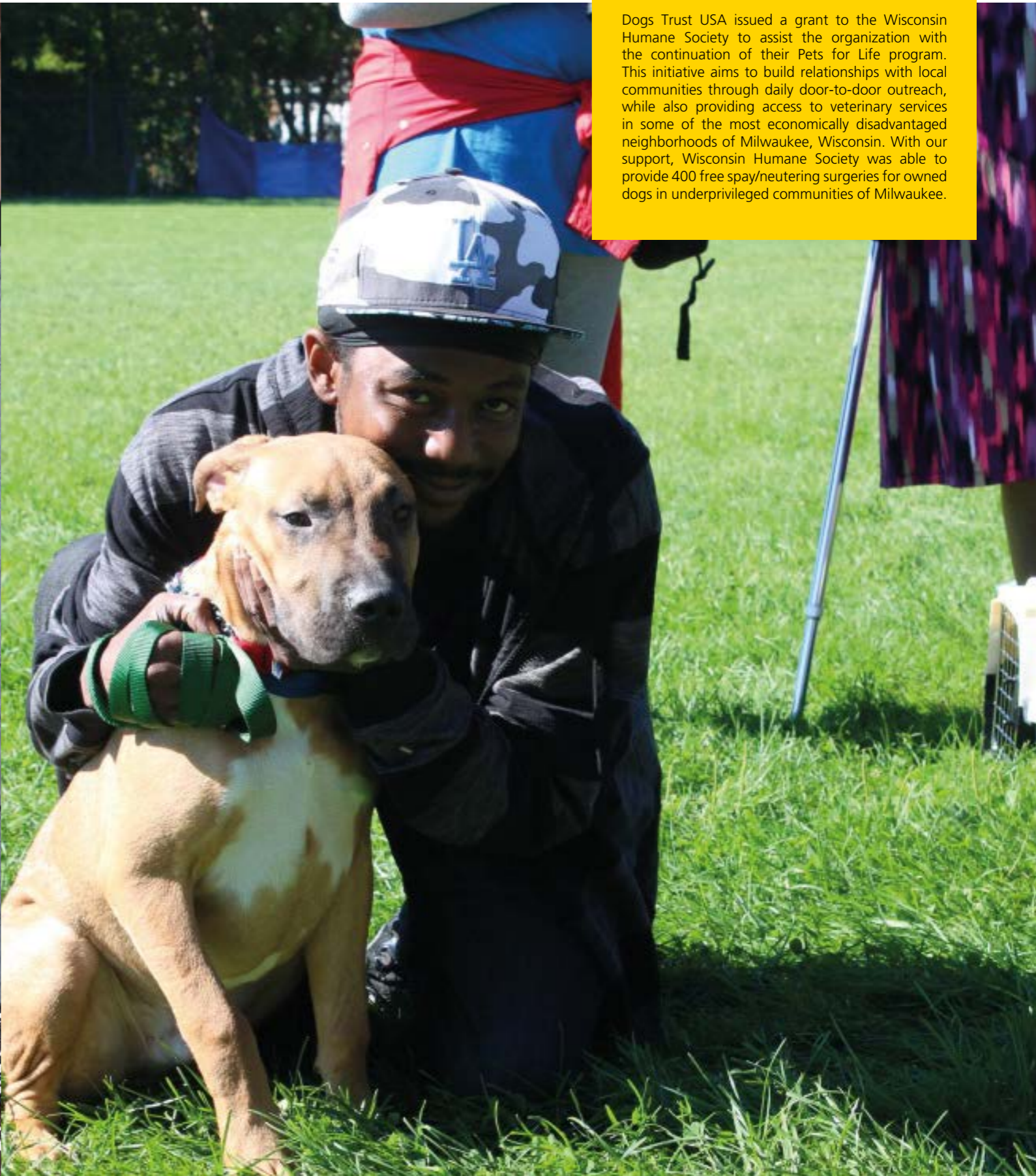
Wisconsin Humane Society, Wisconsin Dogs Trust USA issued a grant to the Wisconsin Humane Society to assist the organization with the continuation of their Pets for Life program. This initiative aims to build relationships with local communities through daily door-to-door outreach, while also providing access to veterinary services in some of the most economically disadvantaged neighborhoods of Milwaukee, Wisconsin. With our support, Wisconsin Humane Society was able to provide 400 free spay/neutering surgeries for owned dogs in underprivileged communities of Milwaukee.