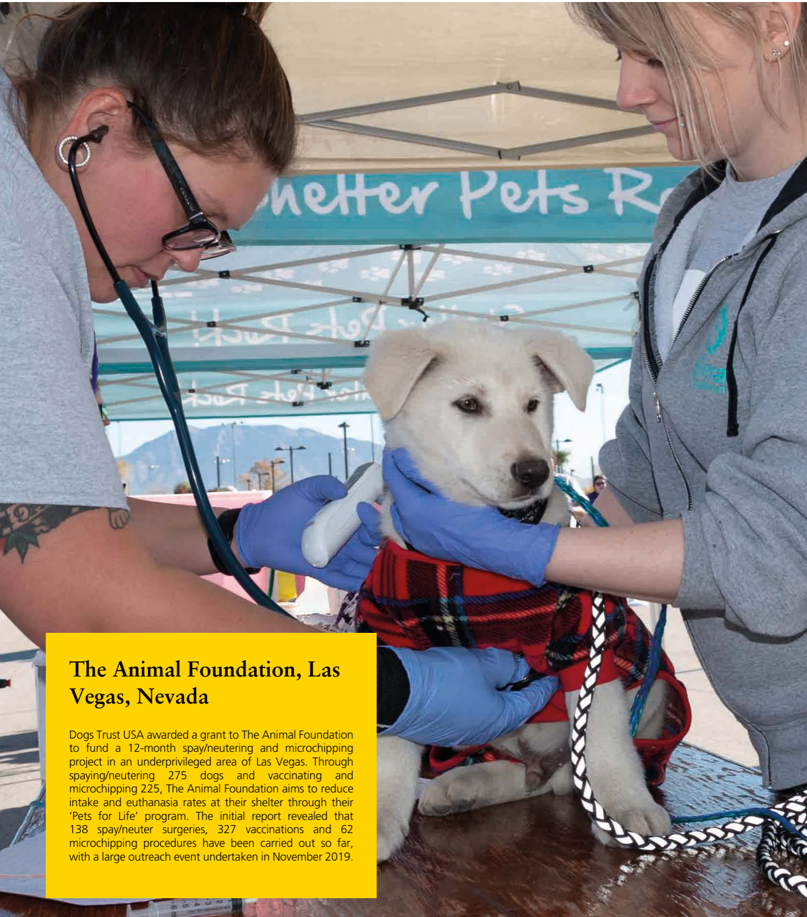
The Animal Foundation, Las Vegas, Nevada Dogs Trust USA awarded a grant to The Animal Foundation to fund a 12-month spay/neutering and microchipping project in an underprivileged area of Las Vegas. Through spaying/neutering 275 dogs and vaccinating and microchipping 225, The Animal Foundation aims to reduce intake and euthanasia rates at their shelter through their 'Pets for Life' program. The initial report revealed that 138 spay/neuter surgeries, 327 vaccinations and 62 microchipping procedures have been carried out so far, with a large outreach event undertaken in November 2019.